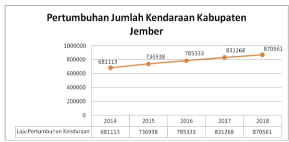
Figure 1. Growth in the Number of Vehicles